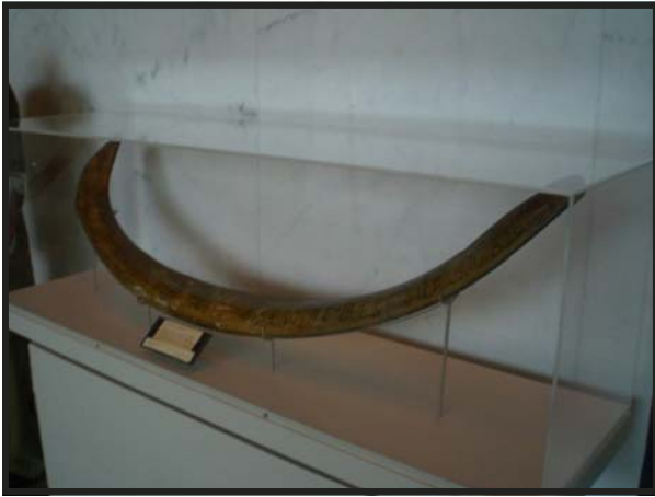
Whale rib from WWII Aleutian Islands Campaign signed by members of the 2-201 Infantry

See more display items at http://pages.suddenlink.net/201st/Display.html