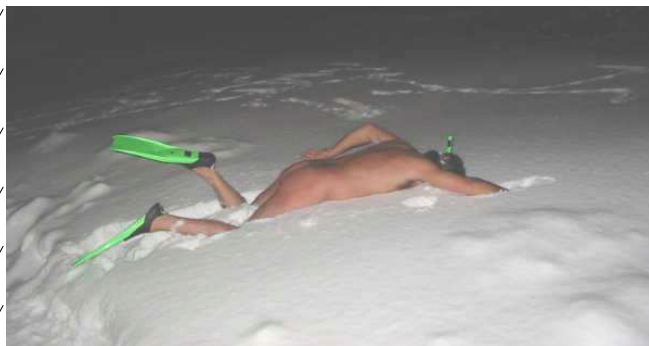
"Snorkeling in Wisconsin"

MACINTOSH CONSULTING • SUPPORT INTERNET SET-UP • HARDWARE • NETWORKING