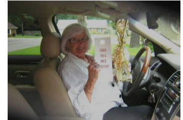
Sold to a Nice Person!