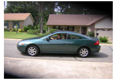
So good - I'll take it!