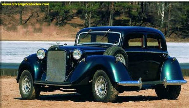
What's weird about this automobile?