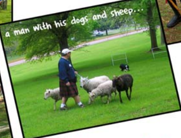
a man with his dogs and sheep...