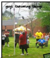
guys throwing things...