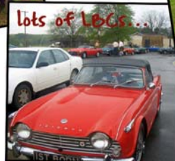
lots of LBCs...