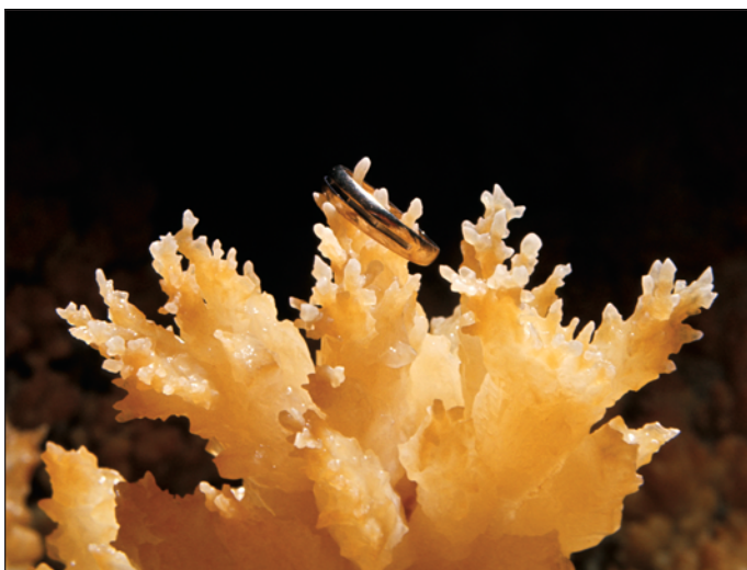
ABOVE: The cave is full of beautiful Coral. Here, a wedding band lends scale. February 1965. Carl Kunath.