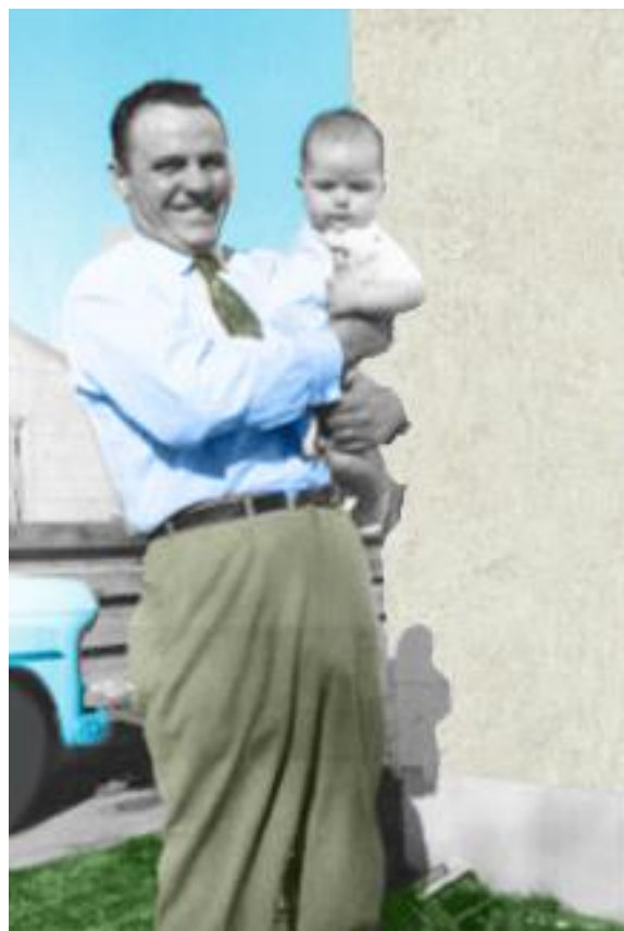
Figure 1: Revised