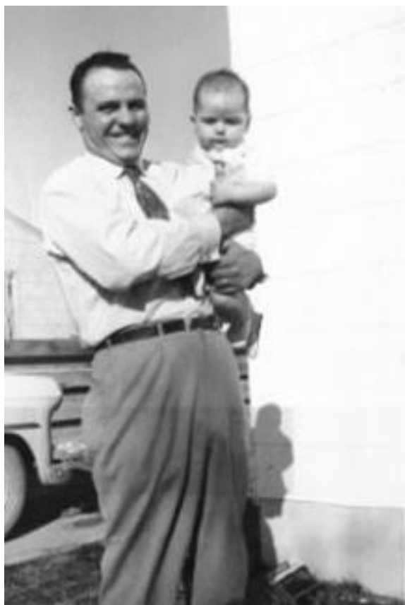
Figure 1: Original