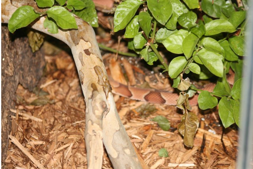
Figure 2: Original