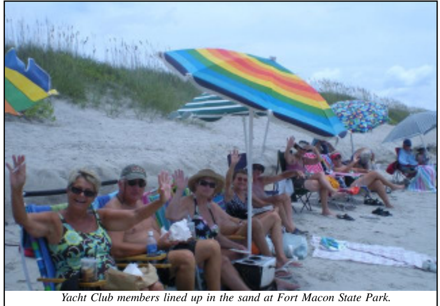
Yacht Club members lined up in the sand at Fort Macon State Park.