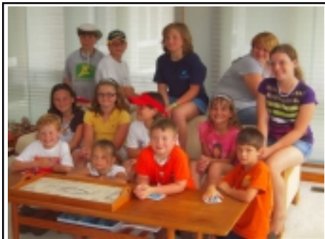
Grandkids gather to accept their participation awards during Grandkids' Week.