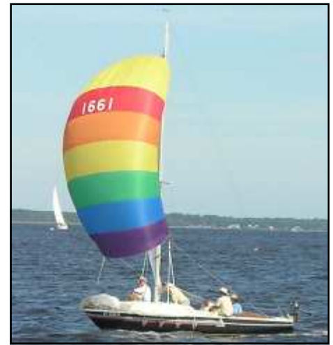
Walt Meyer's boat racing downwind in the Ensign Invitationals