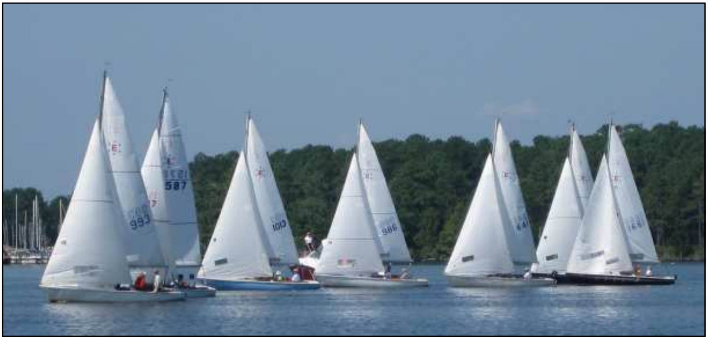
The ensign racing fleet in close quarters during the Ensign Invitational race.