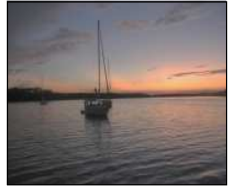
Sunset on the Albemarle