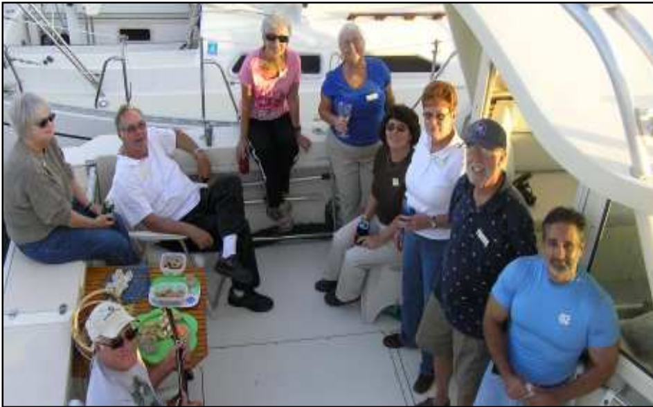
A gaggle of FHYC members enjoying the Harvest Moon raft-up