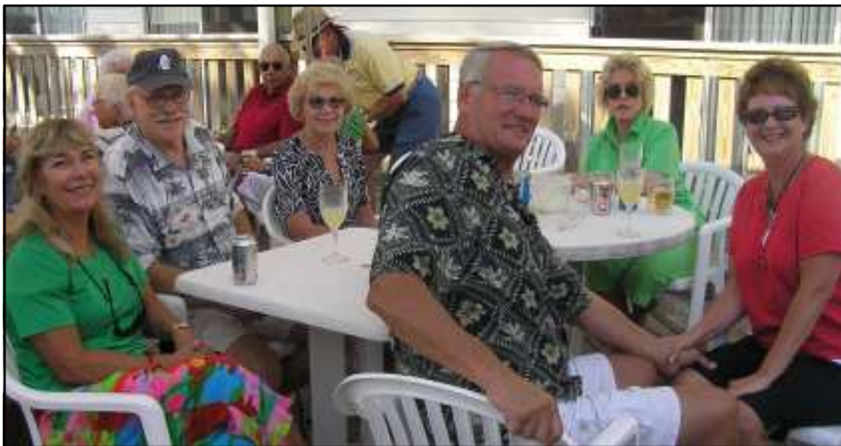
Satisfied customers at the Shrimparoo