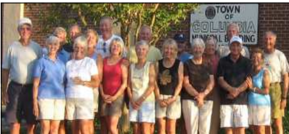
Albemarle Cruise participants say "Cheese"