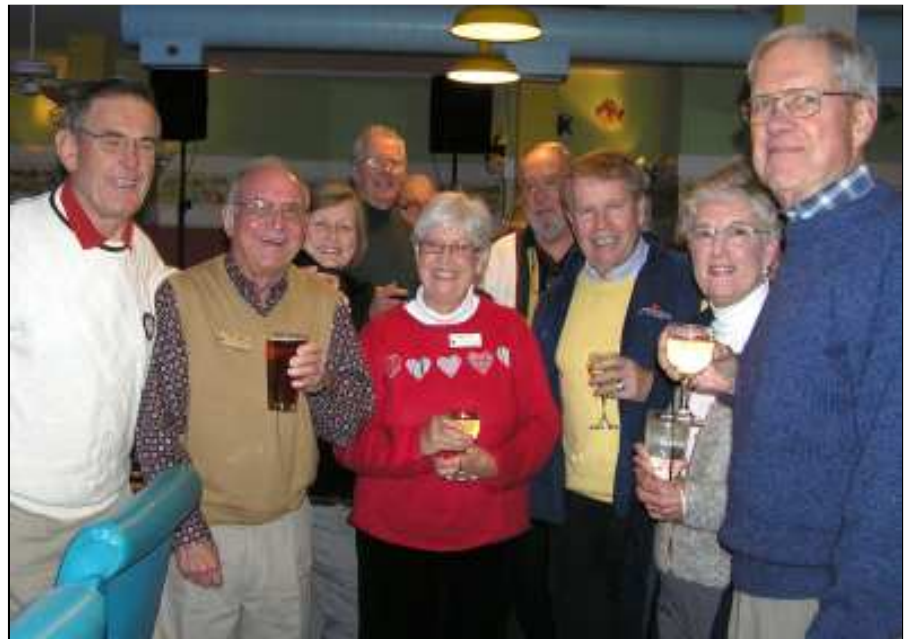
Members enjoying a recent Yacht Club Dinner at the Hurricane Restaurant