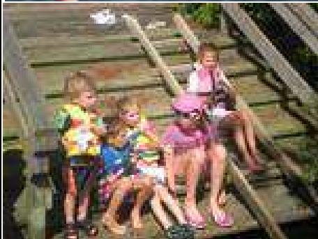
Waiting a turn