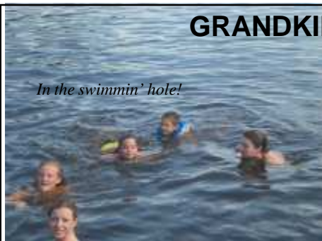
In the swimmin' hole!