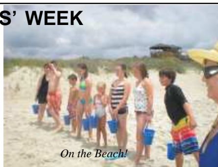
On the Beach!