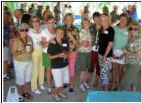
Smiling faces at the Yacht Club's Cheeseburger in Paradise in Margaritaville event.