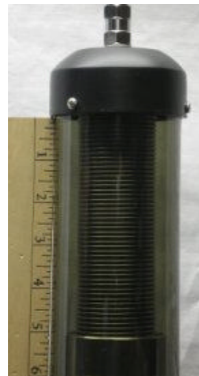
Model 100A-HP -- 7.1 MHz with 5 ft. whip @ 5" of coil showing