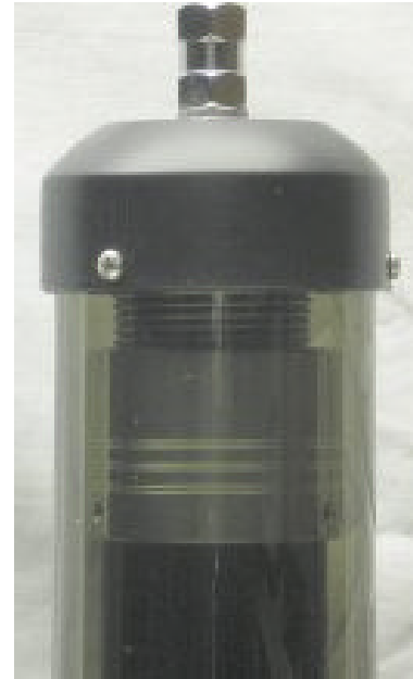
Model 100A-HP -- 21.2 MHz with 5 ft. whip @ 1/2" of coil showing