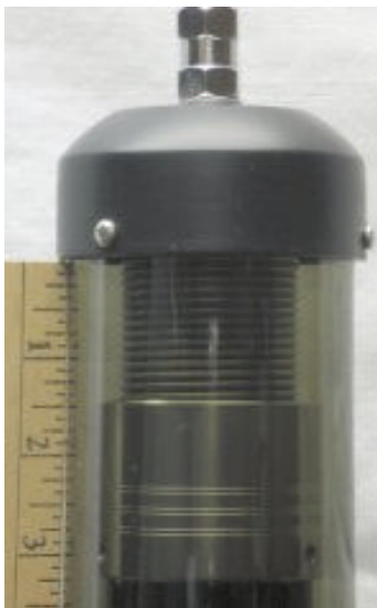
Model 100A-HP --14.2 MHz with 5 ft. whip @ 1 1/2" of coil showing