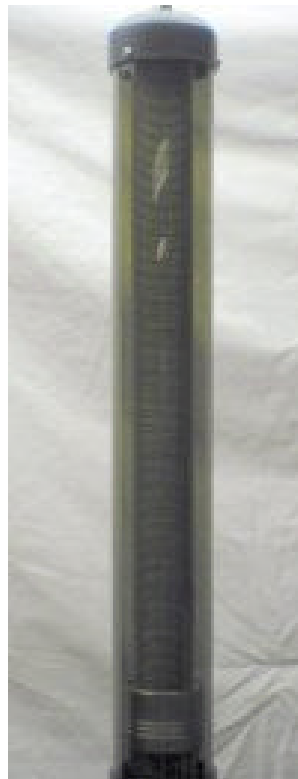
Model 100A-HP -- 3.5 MHz with 5 ft. whip @ 18" of coil showing