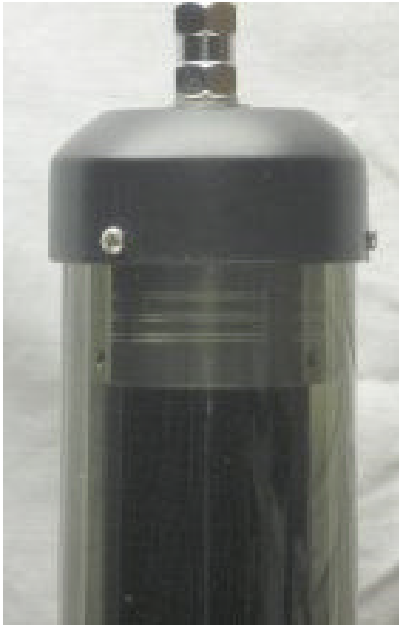
Model 100A-HP -- full down position with 5 ft. whip -- 29.0 MHz

The following photos will show you relative tuning positions of the Model 100A-HP Tarheel Antennas.