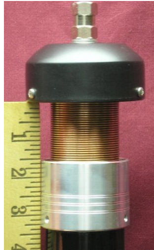
Model 400 -- 7.1 MHz with 5 ft. whip and 1 1/2" of coil showing