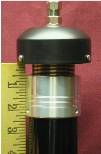
Model 400 -- 14.2 MHz with 5 ft. whip and 1/2" of coil showing