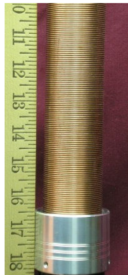
Model 400 -- 8.8 MHz with 5 ft. whip and 16 1/2" of coil showing