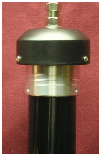
Model 400 -- 21.2 MHz with 5 ft. whip