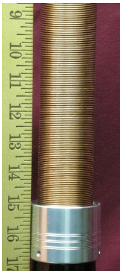
Model 400 -- 1.9 MHz with 5 ft. whip and 15" of coil showing