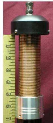
Model 400 -- 3.5 MHz with 5 ft. whip with 5" of coil showing