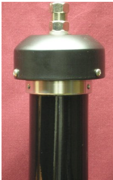
Model 400 -- full down position with 5 ft. whip -- 28.0 MHz