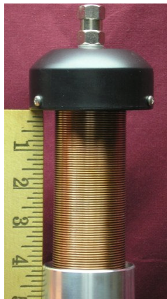
Model 400 -- 3.9 MHz with 5 ft. whip and 4" of coil showing