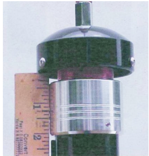
Model 75A "Stubby" -- 14.2 MHz with 5 ft. whip @ 1/2" of coil showing