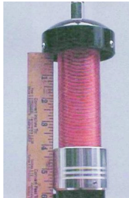
Model 75A "Stubby" -- 3.9 MHz with 5 ft. whip @ 4" of coil showing