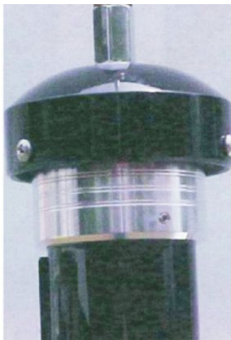
Model 75A "Stubby" -- full down position with 5 ft. whip -- 34.0 MHz