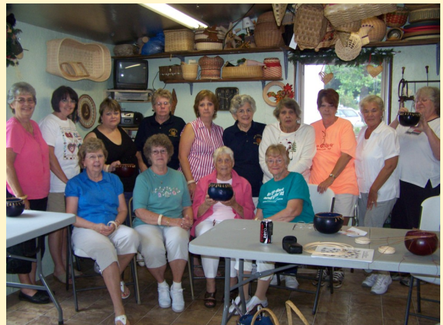
North Central WV Basket Guild Members following their August 29, 2009 Holiday Dinner and gourd weaving project